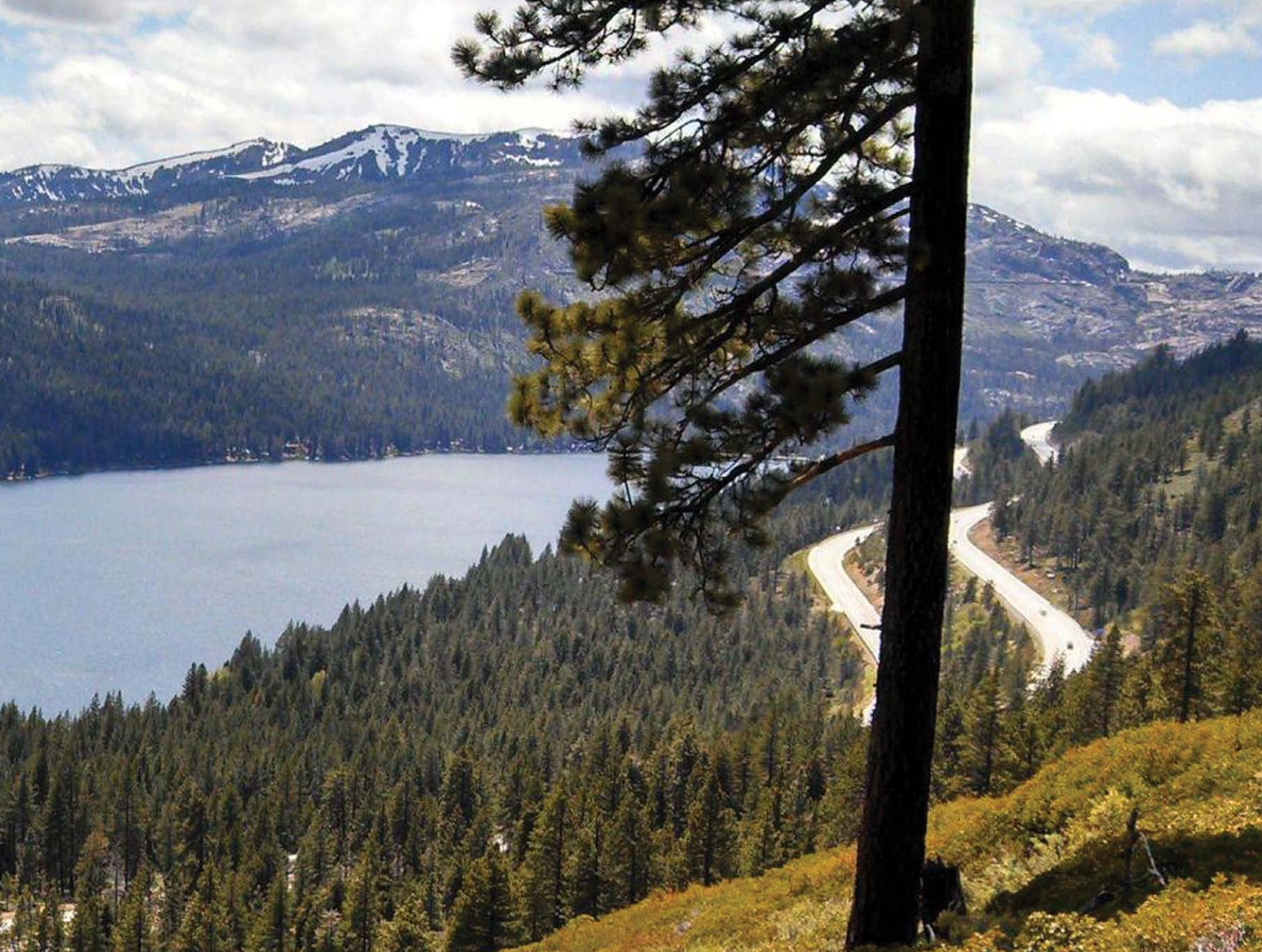
The view from the Bucknam-Sinclair Tract, looking west.

Not all his endeavors succeeded. His scheme to raise imported French frogs in local ponds ended quite badly, particularly for the frogs.